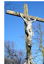
Cross at Montvendre