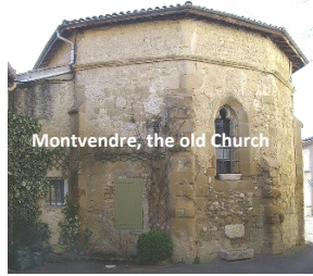
Montvendre, the old Church