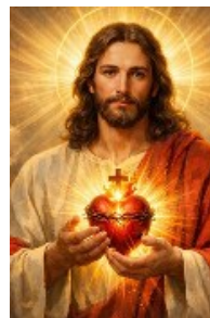
12 June Feast of the Sacred Heart

Sacred Heart of Jesus... I consecrate to you my person and my entire life, my thoughts and deeds, my works and sufferings. Since you desire to be with me and make me your own, I take you, O Sacred Heart of Jesus, as my Rule of life, my sole Treasure, my refuge in the hour of death, and my pledge of eternal Happiness. Amen.